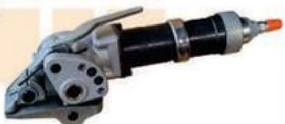
APT PACK PSTTR19/32G

Strap type : Steel strap Strap size (width) : 32mm Strap size (thickness) : 0.8-1.2mm Max tension : 9800n Sealing and seal : N/A Joint strength : N/A Tool weight : 4.8kg Tool dimension (lbh) : 350x140x260mm Air pressure : 4-6bar