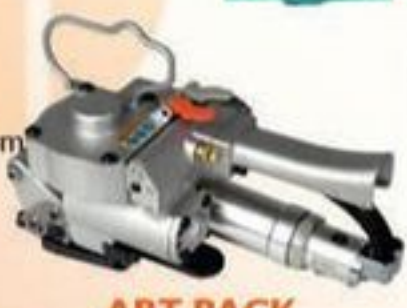
APT PACK AQD 19