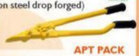
APT PACK H305

Type : Cutter (SAE 4140 high carbon steel drop forged) Strap type : Steel Cutting size : 50x1.27mm Weight : 1 Kg