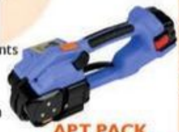
APT PACK DD160/DD 190