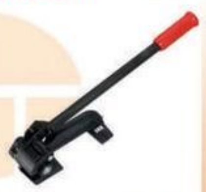
APT PACK S298

Type : Tensioner (feed wheel) Drive : Manual Strap type : Steel strap Strap size (width) : 19/32mm Strap size (thickness) : 0.6-1.0mm Tool weight : 2.9 Kgs