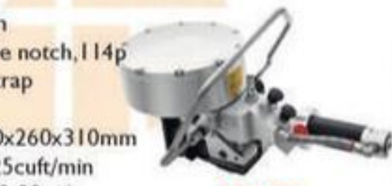
ITI 51/52 (UP CUT JOINT) ITI 61/62 (LOW PRESSURE)

Strap type : Steel strap Strap size (width) : 32mm Strap size (thickness) : 0.6-1.0mm-rd 0.6-0.8mm-high tensile Min tension : 9000n Max tension : 15000n Tension speed : 4-5m/min Sealing type , seal : Double notch, 114p Joint strength : 80% of strap Tool weight : 11.3kg Tool dimension (lbh) : 430x260x310mm Air consumption : 12l/s-25cuft/min Air pressure : 5.5-7bar (78-99psi)