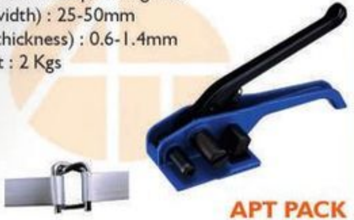
APT PACK P482