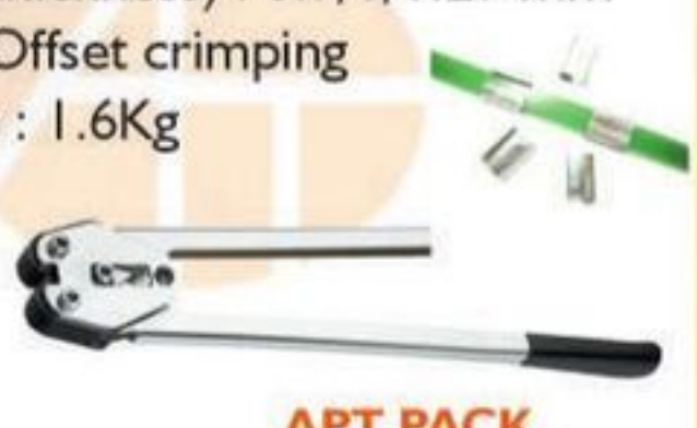
APT PACK C5004/5005/5006