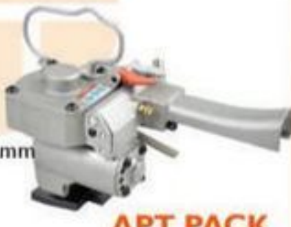
APT PACK RJ 250