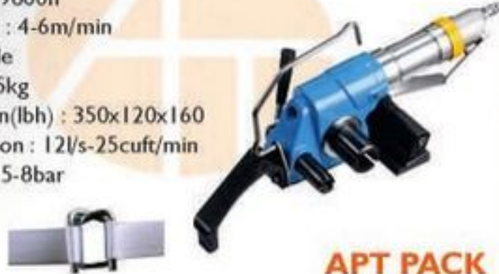
APT PACK PA475

Strap type : Cord strap Strap size (width) : Up to 40mm Strap size (thickness) : 0.6-1.4mm Max tension : 9800n Tension speed : 4-6m/min Sealing : Buckle Tool weight : 5kg Tool dimension (lbh) : 350x120x160 Air consumption : 12l/s-25cuft/min Air pressure : 5-8bar