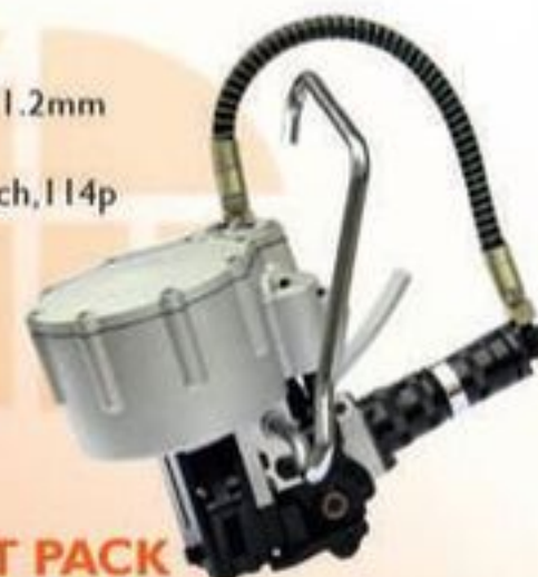
APT PACK PCST32G