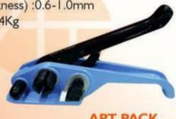
APT PACK P 330