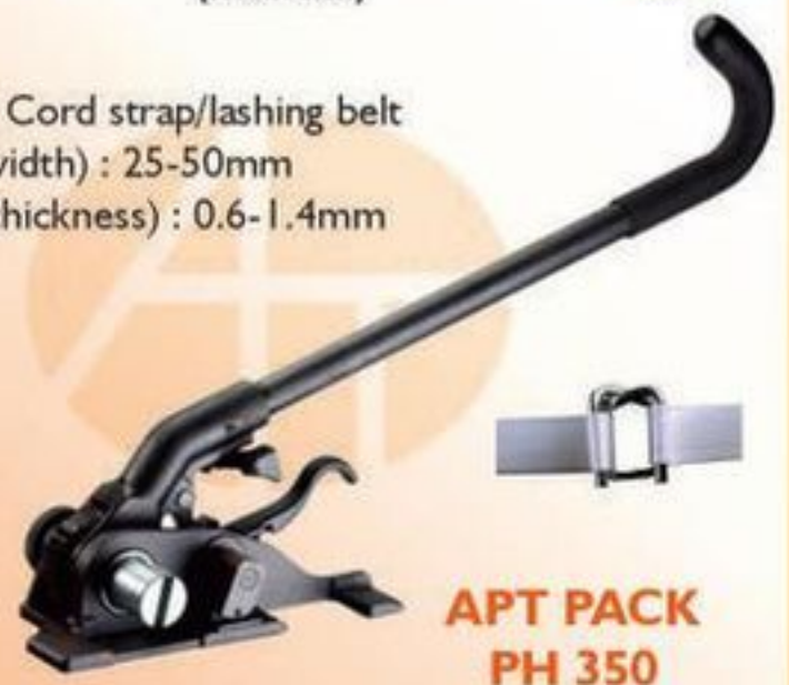
APT PACK PH 350