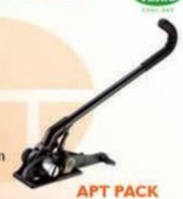
APT PACK S300

Type : Tensioner (windlass) Drive : Manual Strap type : Steel strap Strap size (width) : 19/32mm Strap size (thickness) : 0.6-1.1mm Tool weight : 3.1 Kgs