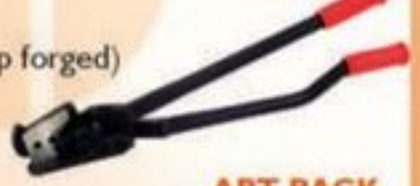
APT PACK H410

Type : Cutter (high carbon steel drop forged) Strap type : Steel Cutting size : 50x1.27mm Weight : 1.2 Kgs