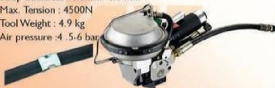
APT PACK SA 106

Drive : Pneumatic Packaging Type : Flat / Round Surface Strap Type : Steel Strap size : 13/19 mm Strap thickness : 0.3mm -0.6 mm Max. Tension : 4500N Tool Weight : 4.9 kg Air pressure : 4-5.6 bar