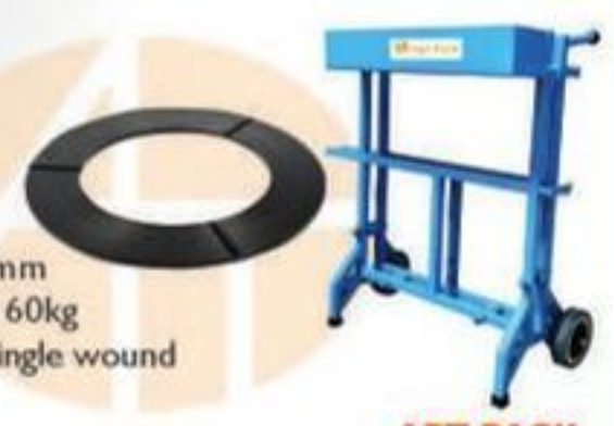
APT PACK SSB32

Type : Dispenser Strap type : steel Strap width : Upto 32 mm Weight of strap : Up to 60kg Wound type : Ribbon/single wound