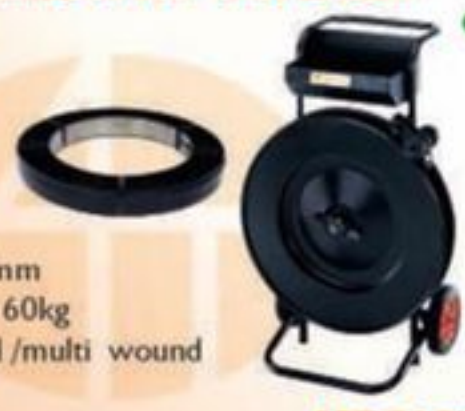
APT PACK CA500HS

Type : Dispenser Strap type : Pet/steel Strap width : Upto 19 mm Weight of strap : Up to 60kg Wound type : Oscilated /multi wound