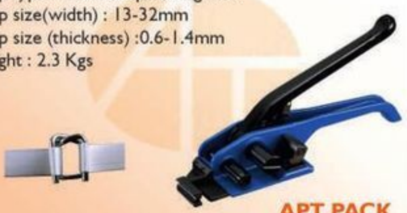
APT PACK P472&475