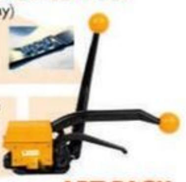
APT PACK A333

Type : Sealless type combination Drive : Manual Strap type : Steel strap Strap size (width) : 12/16/19mm Strap size (thickness) : 0.38-0.6mm Seal type : Sealless type Joint strength : 80% of strap Seal type : Sealless Tool weight : 3.9kg Tool dimension (lbh) : 387x168x308mm