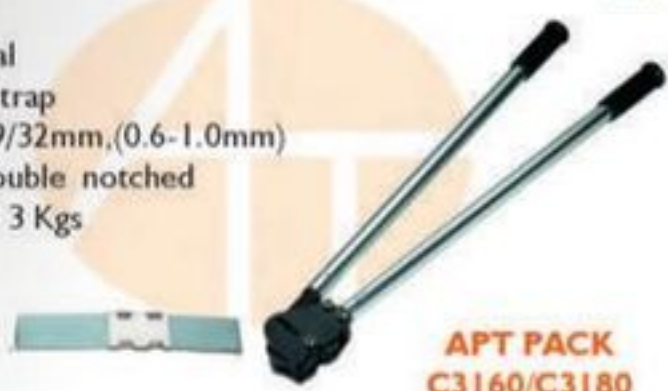
APT PACK C3160/C3180

Type : Sealer Drive : Manual Strap : Steel strap Strap size : 19/32mm, (0.6-1.0mm) Seal type : Double notched Tool weight : 3 Kgs