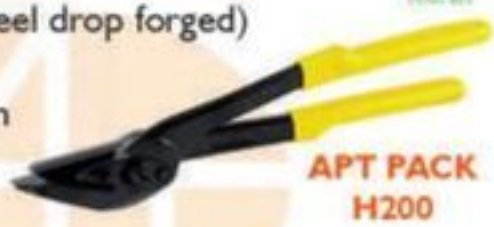
APT PACK H200

Type : Cutter (carbon steel drop forged) Strap type : Steel Cutting size : 32x0.9mm Tool weight : 0.89 Kg