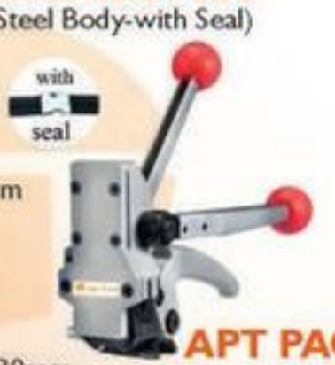
APT PACK ST 36

Type : Pusher type with seal Drive : Manual Strap type : Steel strap Strap size (width) : 19mm only Strap size (thickness) : 0.38-0.6mm Seal type : With seal type Joint strength : 80% of strap Seal type : 34pns (close type) Tool weight : 3.5kg Tool dimension (lbh) : 400x100x330mm