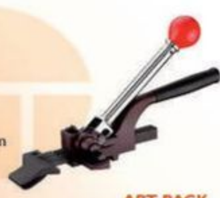
APT PACK S227

Type : Tensioner (rack & pinion) Drive : Manual Strap type : Steel strap Strap size (width) : 19/32mm Strap size (thickness) : 0.6-1.0mm Tool weight : 2.5Kgs