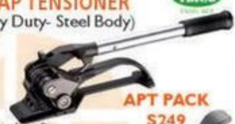
APT PACK S249

Type : Tensioner (pusher feed wheel) Drive : Manual Strap type : Steel strap Strap size (width) : 19/32mm Strap size (thickness) : 0.6-1.0mm Tool weight : 4Kgs