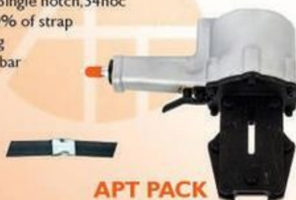
APT PACK PSS-19/32G