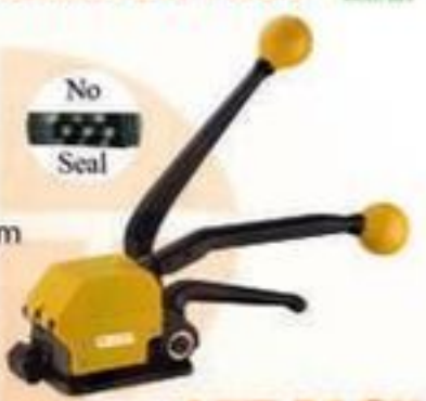
APT PACK SL200 / ST 32

Type : Sealless type combination Drive : Manual Strap type : Steel strap Strap size (width) : 12/16/19mm Strap size (thickness) : 0.38-0.6mm Seal type : Sealless type Joint strength : 80% of strap Seal type : Sealless Tool weight : 3.9kg Tool dimension (lbh) : 400x100x330mm