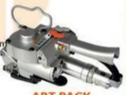
APT PACK AQD 25